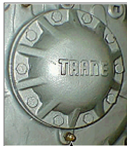
Style A & B

Trane Oil-15 is the only factory recommended refrigeration oil to be used in these compressors. The introduction of any other oil(s) can cause swelling of the unloader "O" rings resulting in erratic unloader operation or complete unloader failure. After years of satisfactory usage in many installations across the USA, Dallas Hermetic Company, Inc. has determined that Zerol (tm) 300 refrigeration fluid is an acceptable alternative lubricant for use in their remanufactured Trane compressors.